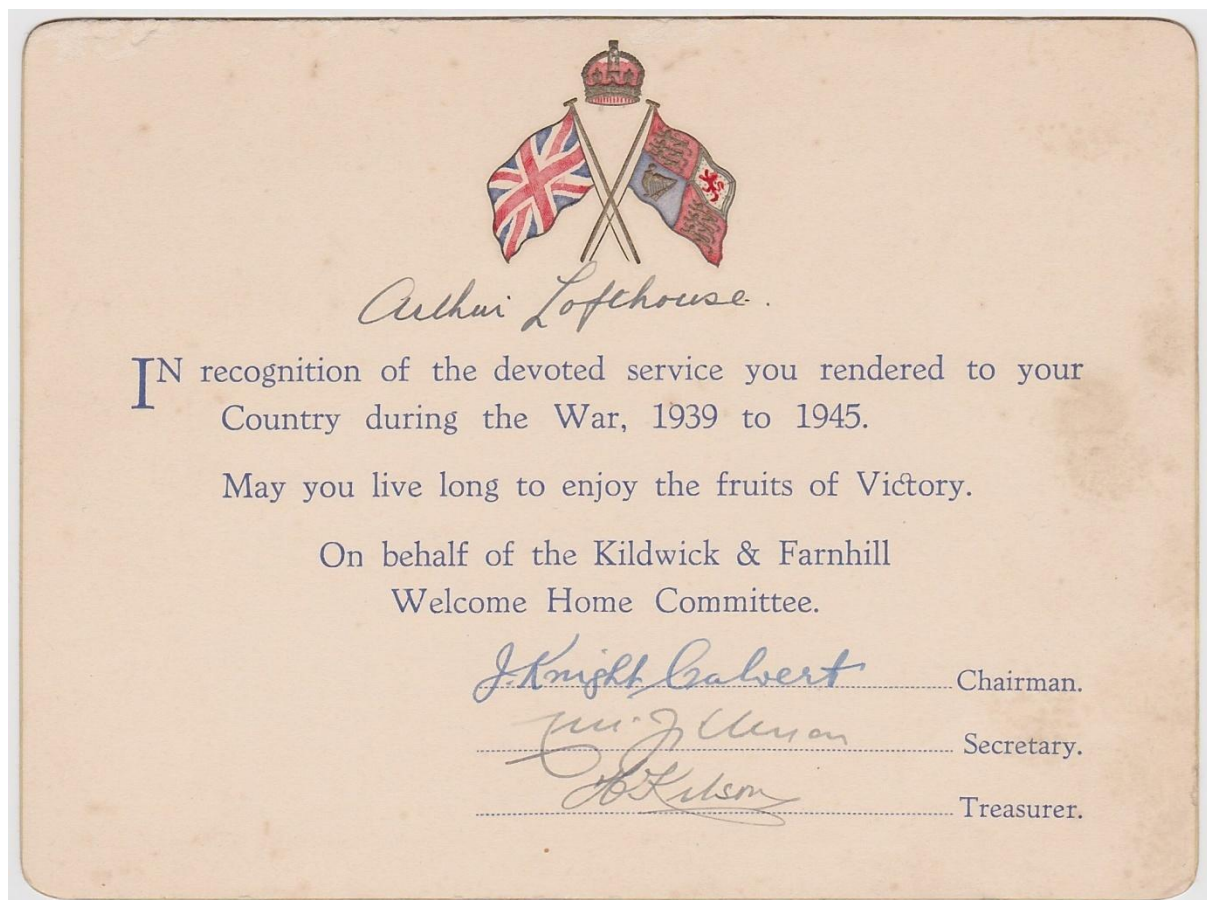
Figure 4: An example of the Welcome Home Fund's commemoration card – this one presented to the late Arthur Lofthouse

An example of the presentation cards distributed at this event is shown below.